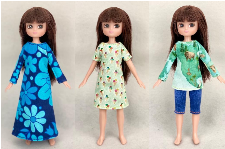
Lottie (7 inches) is showing long dress, short dress and tunic.