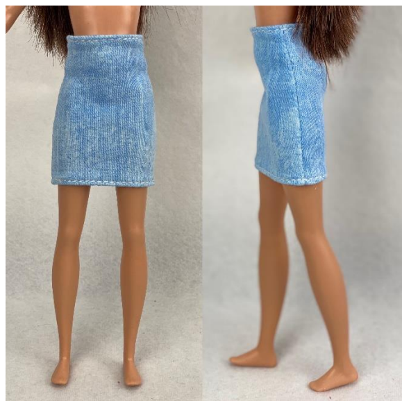
Skipper in a pencil skirt.