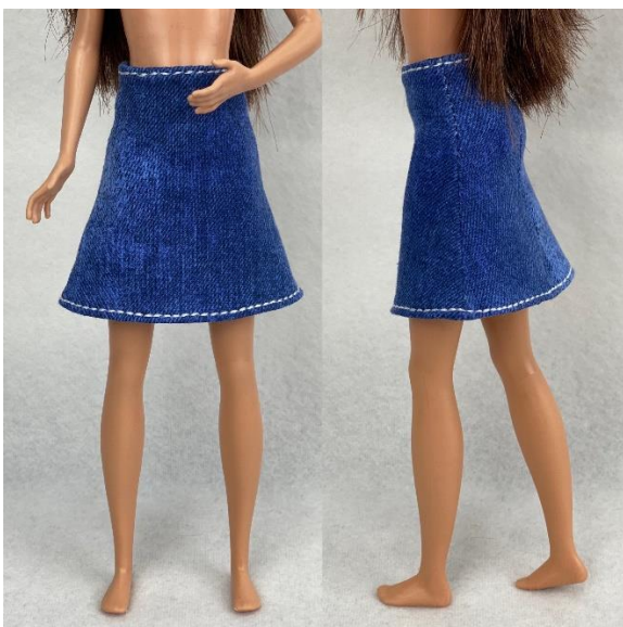
Skipper in an A-line skirt.