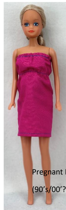
Pregnant Barbie copy (90's/00'?)